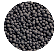
30/50 PropRaider ®