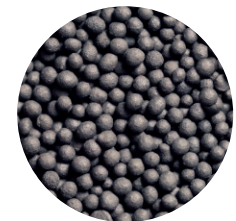
20/40 PropRaider ®