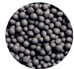
16/30 PropRaider ®